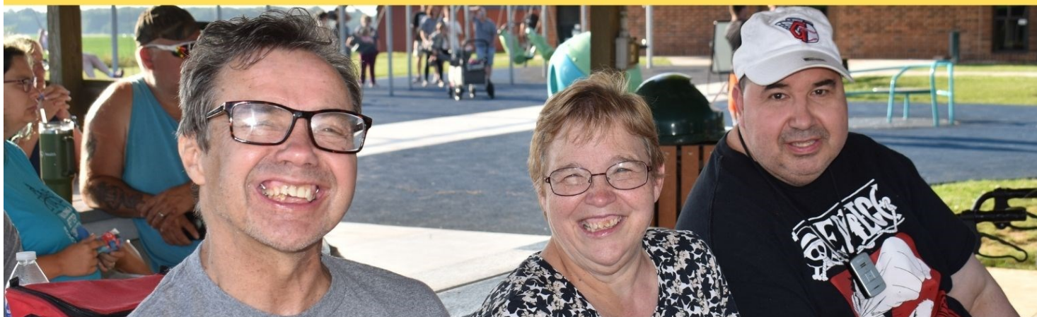
ACT Council sponsored Ice Cream Treats and Tunes at Opportunity Park for family and friends.

Our Mission: To improve the lives of persons with disabilities