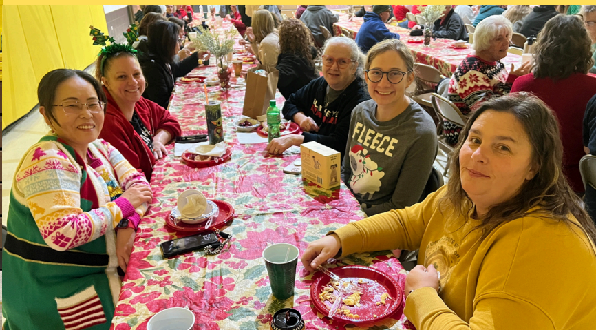
SCOC had a staff breakfast hosted by management team to express their gratitude to staff for their hard work and dedication throughout the year.